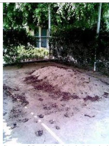
Grave of Syed Abul Aala Maududi