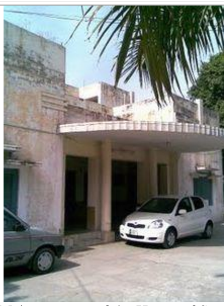
Main entrance of the House of Syed Abul Aala Maududi 4-A, Zaildar Park, Ichhra, Lahore